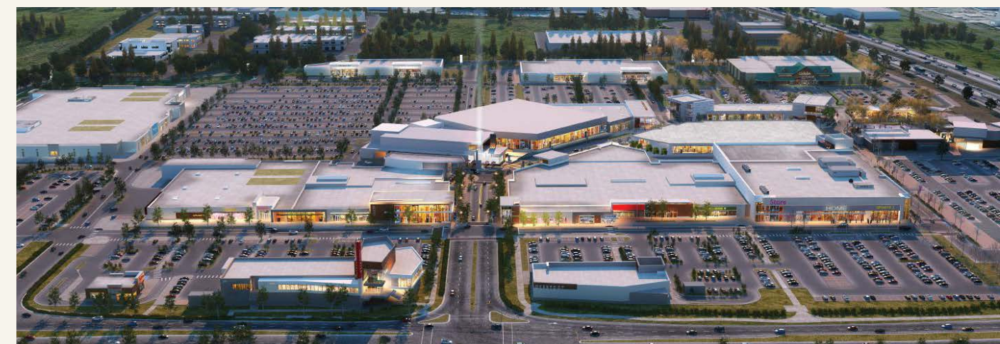
Destination: Deerfoot City, AB