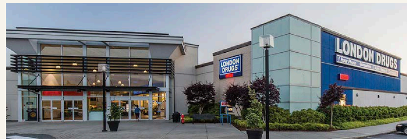
Nanaimo North Town Centre, BC