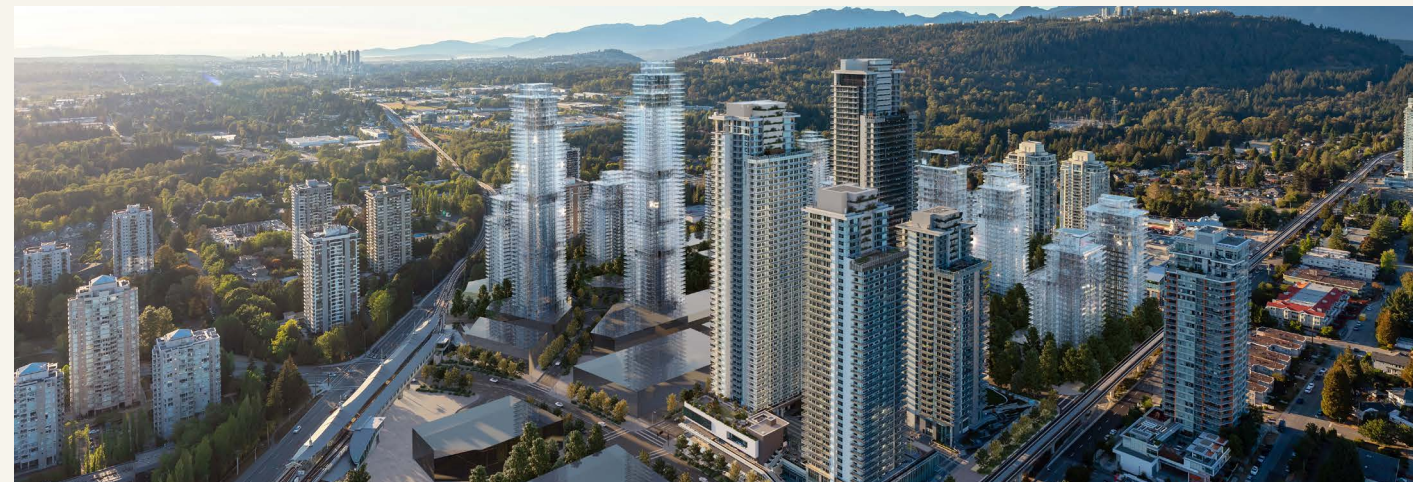
The City of Lougheed, BC

SHAPE is the real estate investment, development and management company behind Canada's most significant centres of gravity. From master plans to retail destinations, we raise the bar for industry, quality of life and return on investment.