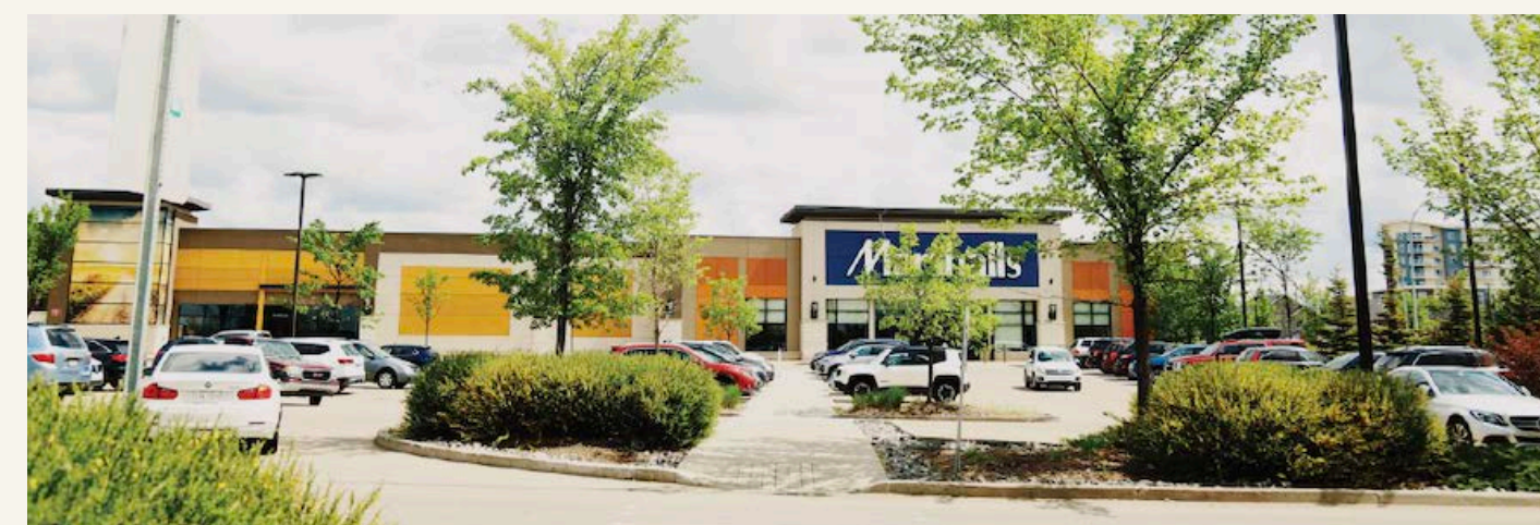
Emerald Hills Centre, AB