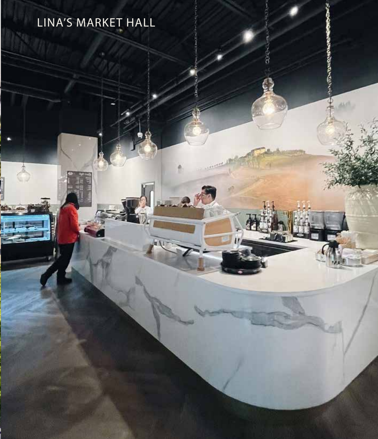
LINA'S MARKET HALL