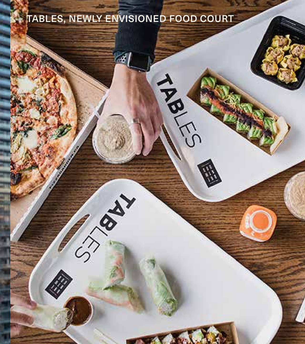
TABLES, NEWLY ENVISIONED FOOD COURT