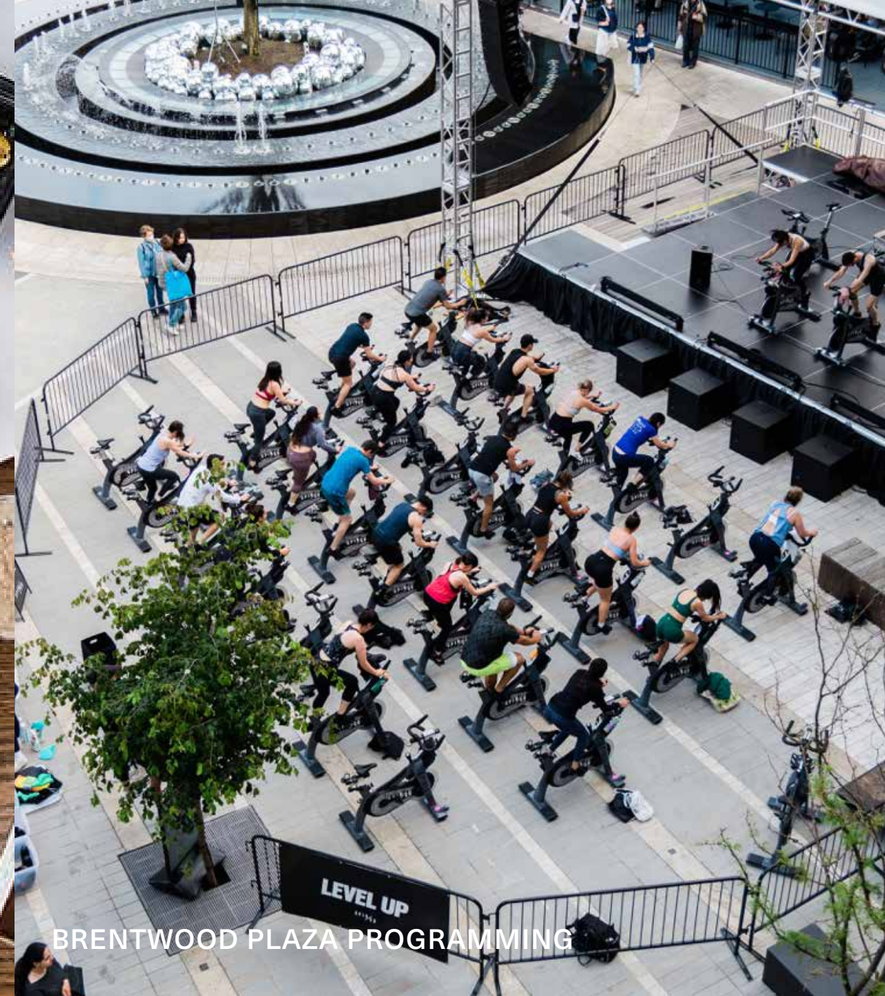
BRENTWOOD PLAZA PROGRAMMING