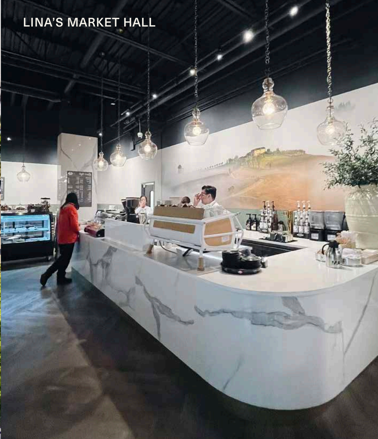
LINA'S MARKET HALL