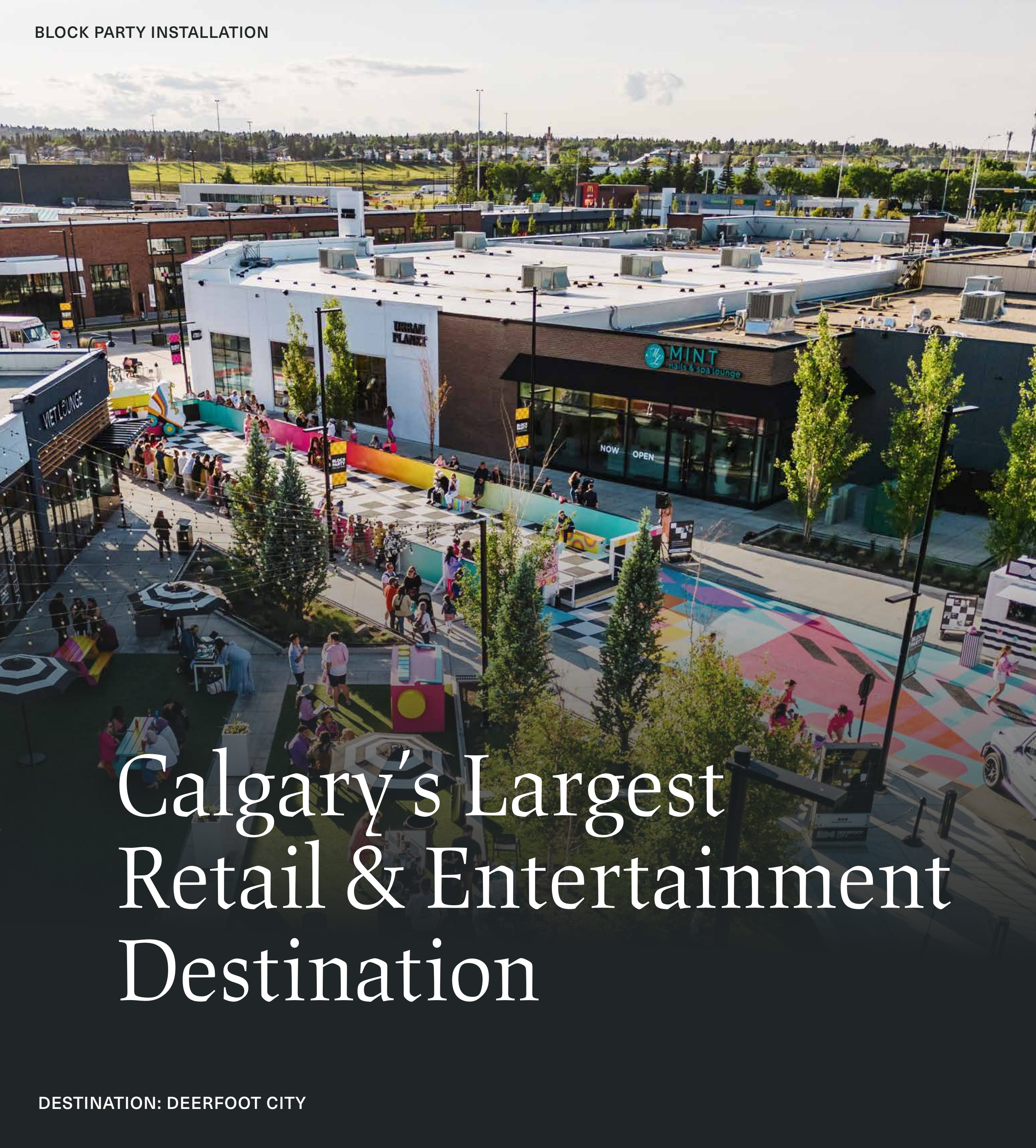
BLOCK PARTY INSTALLATION